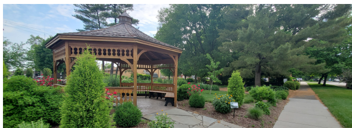
Friendship Garden 1698 Lafayette Avenue Mattoon, IL 61938

100% of membership fees support our educational programs and conservation projects at all three of our properties.