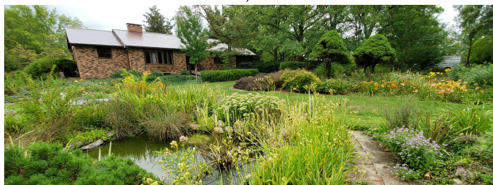
The Whiteside Garden 8422 NCR 1820 E Charleston, IL 61920